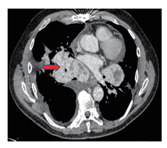
Figure 1. Chest CT scan: expansive lesion in the right anterior mediastinum (arrow). CT: computed tomography.

of 9 \times 7 \times 9 mm, lobulated edges, and thick calcification. Rest of the thyroid parenchyma is heterogeneous and compatible with thyroiditis (Fig. 3). Fine needle aspiration (FNA) biopsy of thyroid micronodule concluded Hashimoto's thyroiditis.