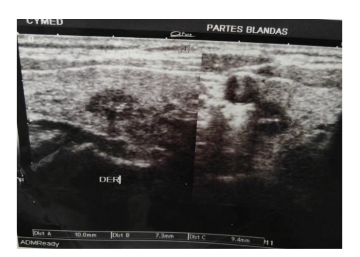
Figure 3. Cervical ultrasound shows hypoechoic nodule in the right thyroid lobe of 9 \times 7 \times 9 mm.

dyspnea. A follow-up CT of the chest reported a right pleural effusion, and a conglomerate of mediastinal and hilar adenopathies of up to 4 cm. Calcitonin was 1,113 pg/mL on follow-up. Oncology proposed radiotherapy 45 Gy/28 to the mediastinum and 40 Gy/16 to the vertebral injury in T9, and later, five courses of chemotherapy with cisplatin plus etoposide. Follow-up at 6 months showed serum calcitonin of 1,411 pg/mL.